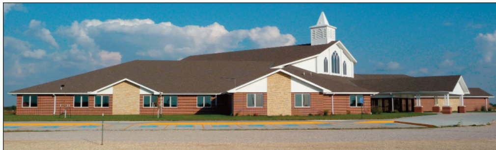
The new building, above, while modern in appearance and building materials, utilizes design elements that are reminiscent of the older building, below, including the shape of the sanctuary windows and the use of white exterior finishes on the upper facade of the sanctuary.

“Max has had some great insights as the committee is considering the plans. He and Kelly have very good people skills and are good at analyzing people’s responses to see how an